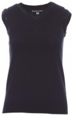
NAVY BLUE 08007

COMPOSITION: 90% COTTON + 10% WOOL APPEARANCE: COTTON AND WOOL BLEND WEIGHT: 280 GR/MQ SIZES: S-M-L-XL-XXL PACK: 1/50 HS CODE: 61102099 MADE IN: BD